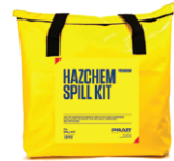
50L HAZCHEM SPILL KIT LIQUID ABSORBANT CAPACITY: 43-61L PRODUCT CODE: NZSKH050