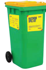
120L HAZCHEM SPILL KIT LIQUID ABSORBANT CAPACITY: 122-134L PRODUCT CODE: NZSKH120