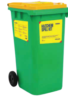
240L HAZCHEM SPILL KIT LIQUID ABSORBANT CAPACITY: 192-255L PRODUCT CODE: NZSKH240