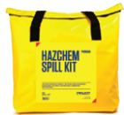
25L HAZCHEM SPILL KIT LIQUID ABSORBANT CAPACITY: 18-30L PRODUCT CODE: NZSKH025

FOR HAZCHEM LIQUID SPILL ABSORPTION: Designed for acids, alkalis, coolants, paints, oils and fuels, they are made from inert materials which will not react with any absorbed liquids. For general industry and non-industry applications.